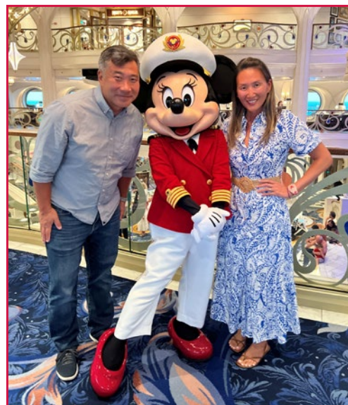
Cruising with the Mouse this summer