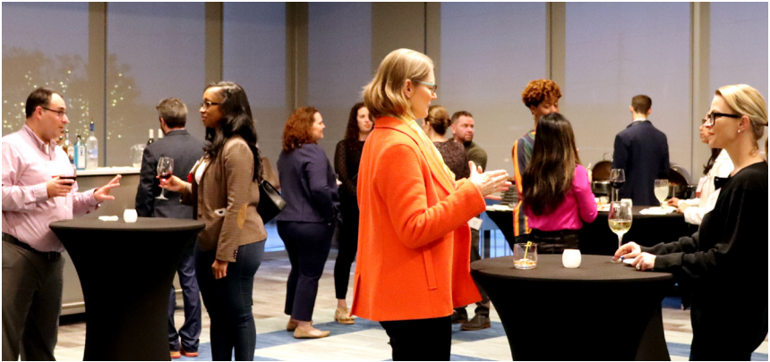
Holiday Party and Sponsor Appreciation Event.