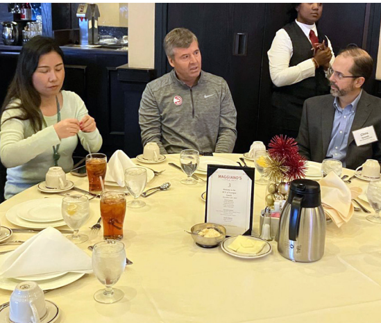
ACC GA members enjoying CLE Luncheon.