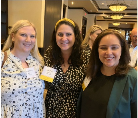
ACC GA members enjoying CLE Luncheon.