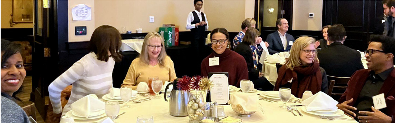
ACC GA members enjoying Willenken CLE Luncheon.