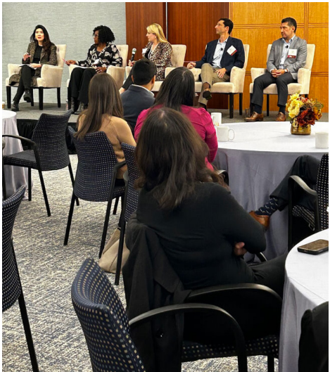
ACC GA members presenting at Deep Dive event.