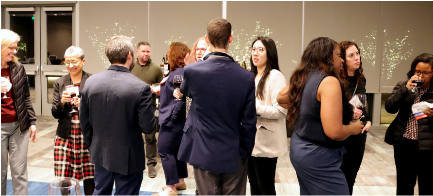
Holiday Party and Sponsor Appreciation Event.