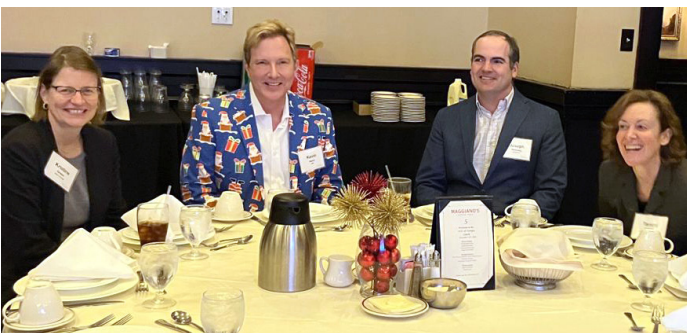
ACC GA members enjoying Willenken CLE Luncheon.