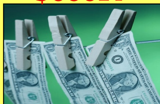
E-DISCOVERY COST OF REVIEW**

OFFSHORING FIRST LEVEL REVIEW RESULTED IN >70% COST REDUCTION